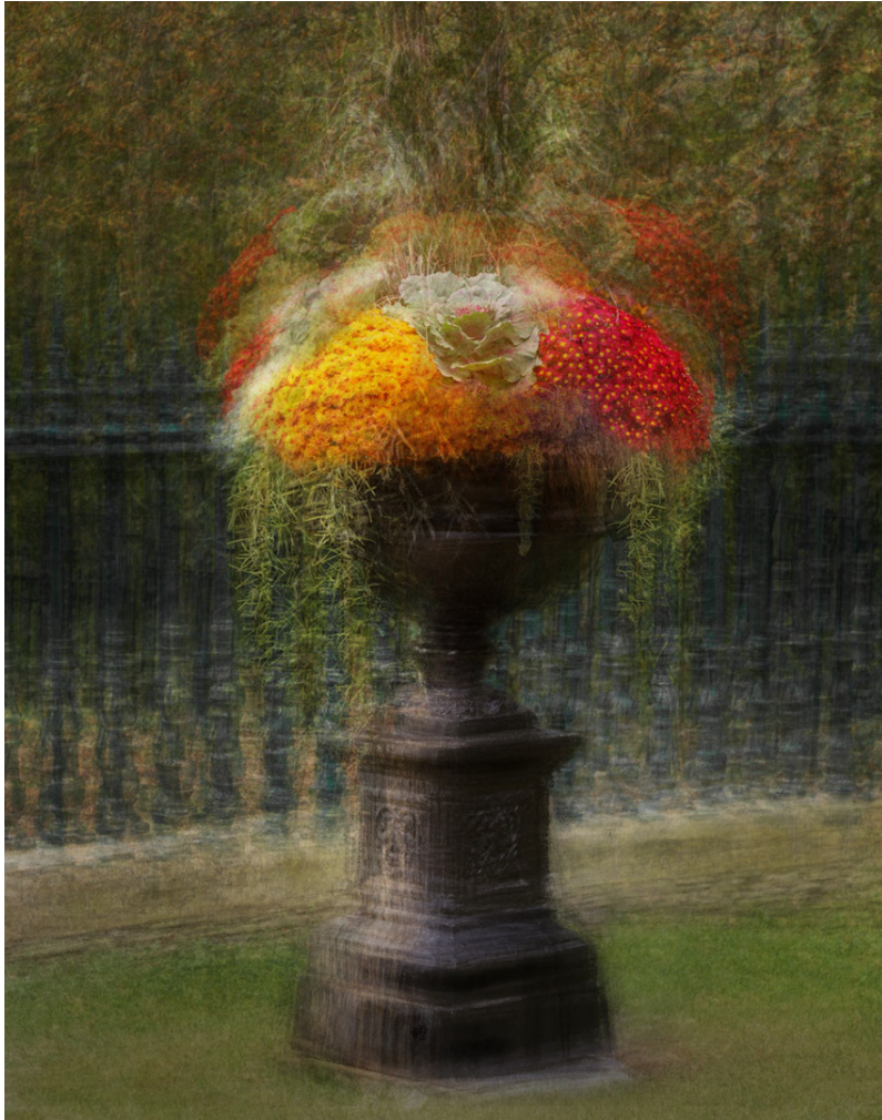
'Mellow Season' - Doris