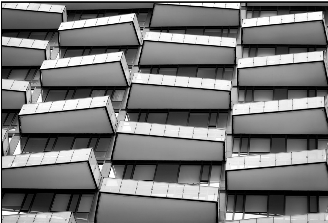
'Stacked' - Doris