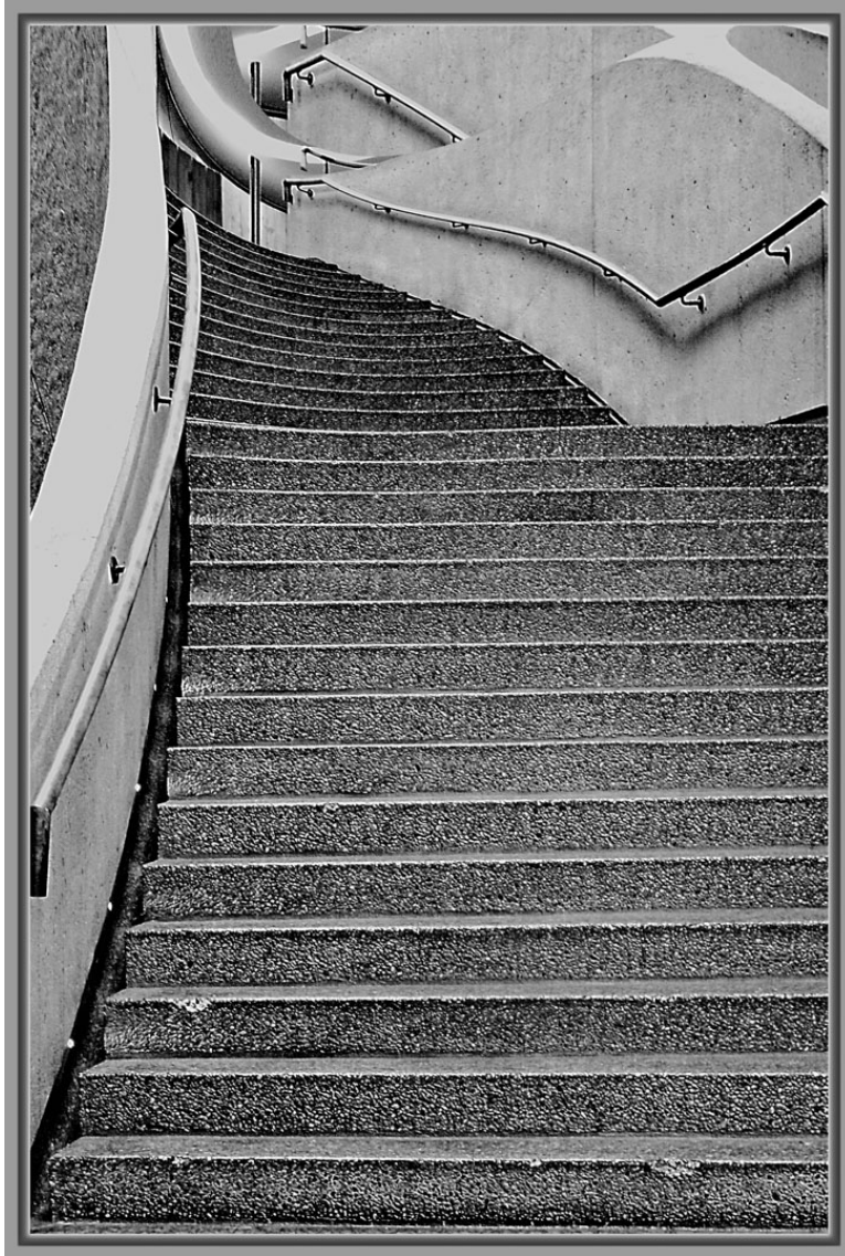
'Destination Unknown' - Mort