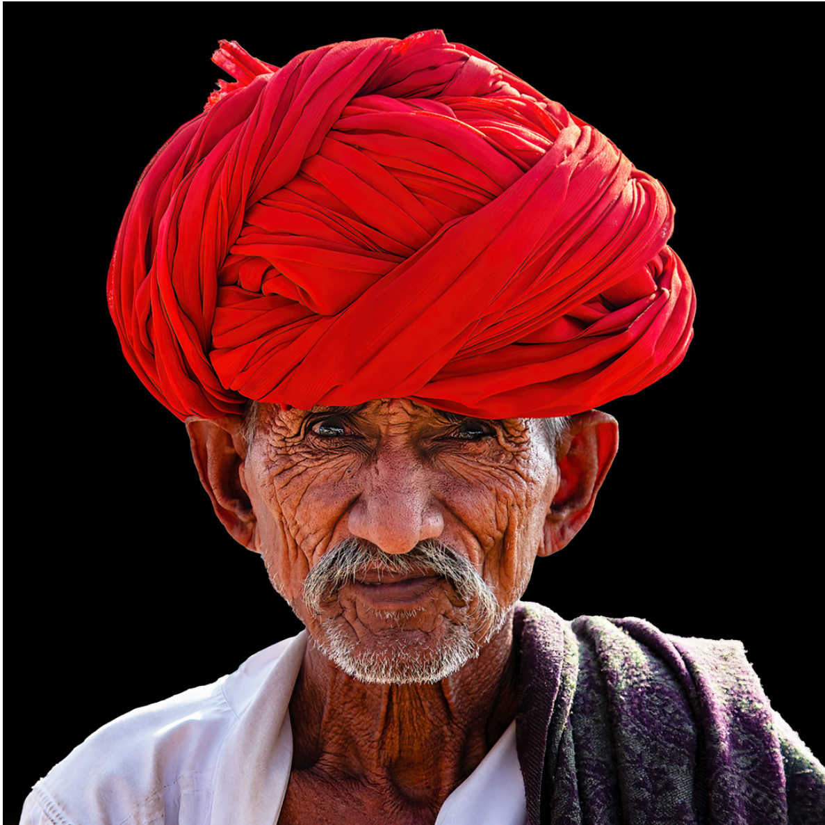
'Camel Herder' - Dass

"It's easier for a rich man to ride that camel through the eye of a needle directly into the Kingdom of Heaven, than for some of us to give up our cell phone."