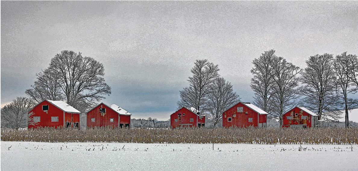
'1 to 5' - Laurence