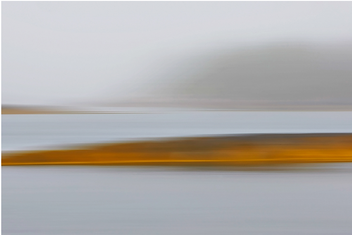
'Gold Bar' - Nick