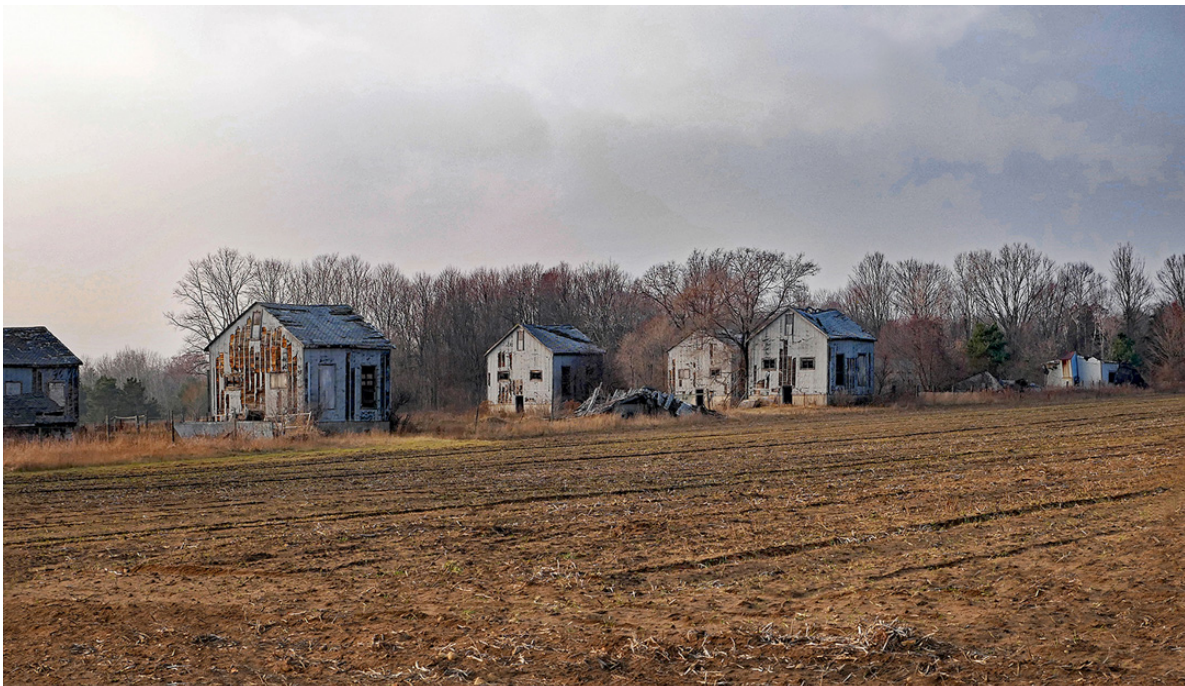
'A Disappearing Era' - Laurence