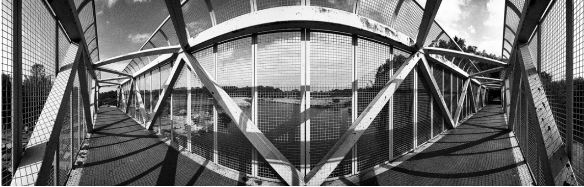
'Decisions' - Nick