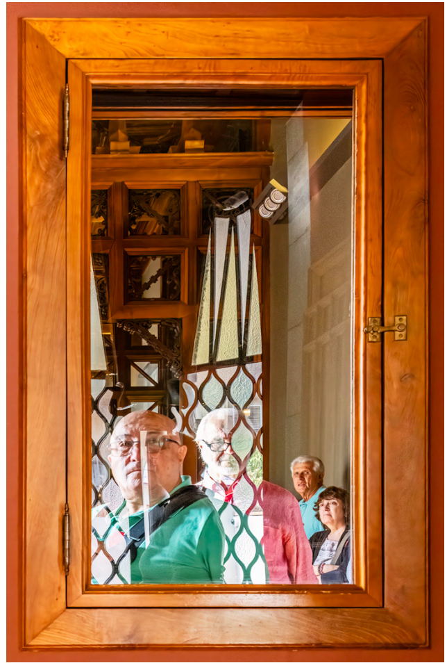
'Window' - Dass