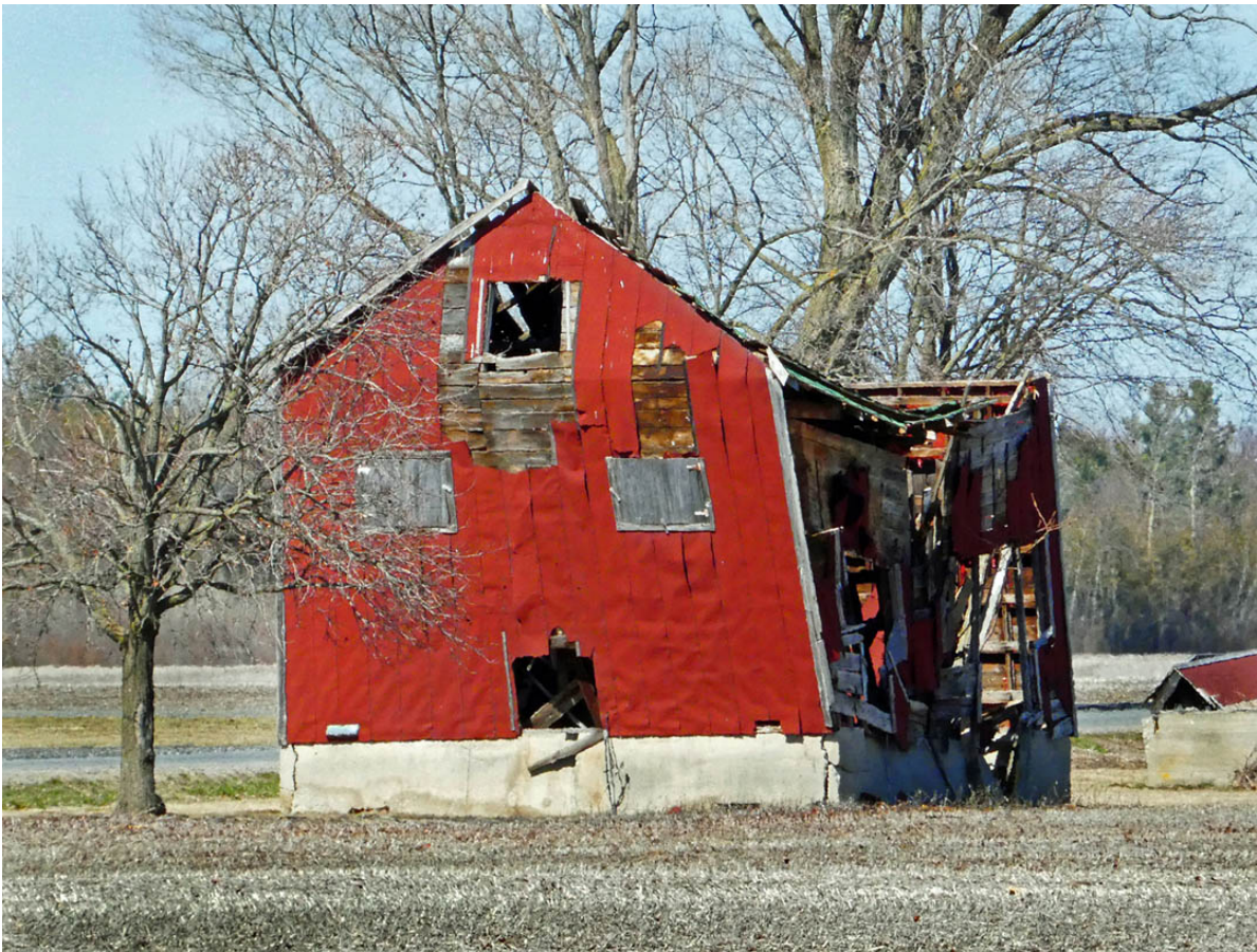
'Still Standing but Not for Long' - Laurence