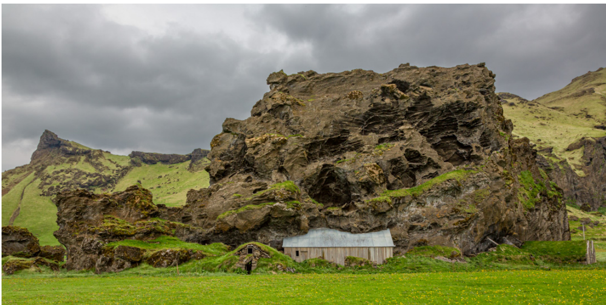
'Hungry Mountain' - Leif

"The mountain offers us the scenery...it's up to us to invent the story that goes with it."